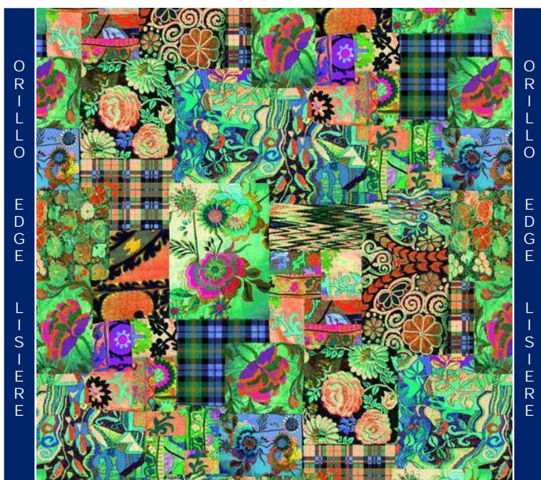
TIZIAN KERALA Reference 034105334

Composition: 100%PES Useful width in cms: 140 cm. Pattern repeat (height): 179,3 Pattern repeat (width): 140 Repeat for cutting cm.: 179,3 Design direction: Up the roll Weight sm: 443 Suitable for upholstery. Martindale 30000 cycles. Ligth fastness: 5/6 Pilling: 4/5 Shrinkage (warp): -0,10 % Shrinkage (weft): -0,40 %