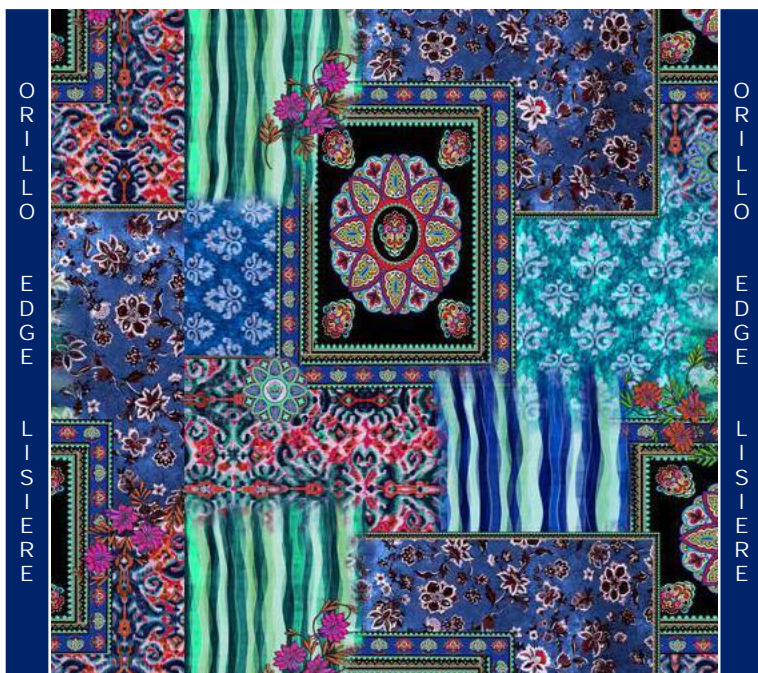
TIZIAN KOLIBRI Reference 034105204

Composition: 100%PES Useful width in cms: 140 cm. Pattern repeat (height): 96,2 Pattern repeat (width): 140 Repeat for cutting cm.: 96,2 Design direction: Up the roll Weight sm: 443 Suitable for upholstery. Martindale 30000 cycles. Ligth fastness: 5/6 Pilling: 4/5 Shrinkage (warp): -0,10 % Shrinkage (weft): -0,40 %